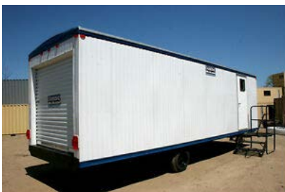
Photo shown above is an example of a layout only and does not meet all EBC requirements.

EXCEPTION: Temporary Construction Trailers. A temporary building used for construction purposes shall be defined as any building or shed which is temporary, does not exceed 8 feet in width and 32 feet in length, is used for the storage of materials and equipment, and may include a small office for a construction superintendent to use for functions, which are exclusively for construction purposes. Temporary manufactured buildings, which meet this definition, are exempt from the requirements of the following: accessibility, Department of Business and Professional Regulation (DBPR) approval, sealed engineering, energy calculations, and emergency egress illumination. Following is an example of an approved Temporary Construction Trailer layout per EBC J-101.2(h) :